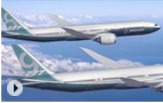
Will Boeing's New 777X Steal the Dubai Air Show?