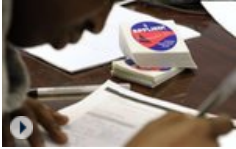
The New Reality of College Admissions