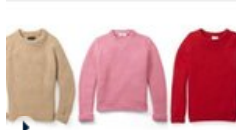
Why That Chunky Sweater Is $1,000