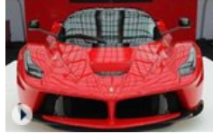
Top Five Luxury Dream Cars for 2014